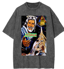
#4.Grey. The Rapture.